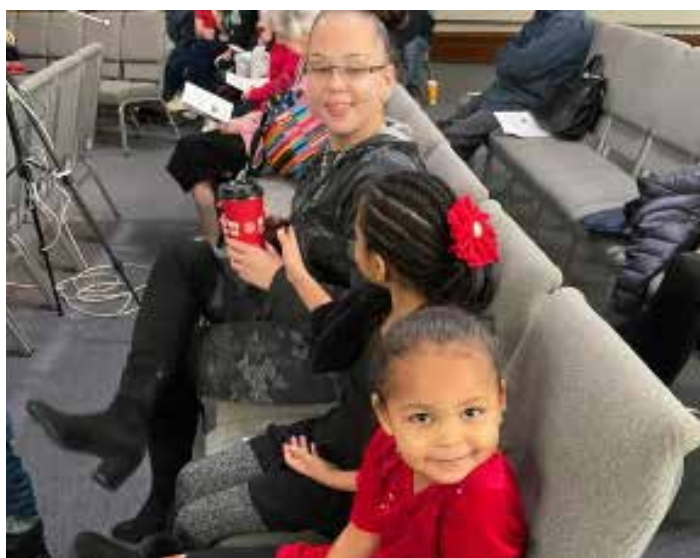
A special Christmas family worshipping at a Sunday Morning Christmas service.