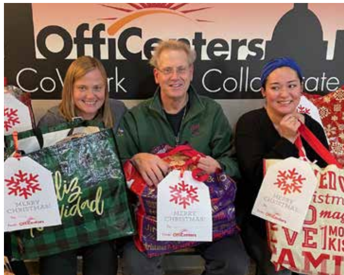
The staff at OffiCenters blessed a special family for Christmas. Thank you so much!