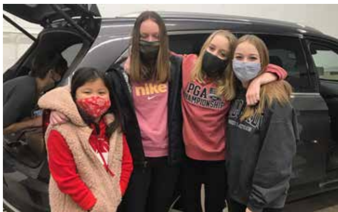
These teenagers are from Westwood Church helping to deliver Christmas In The City 2020.