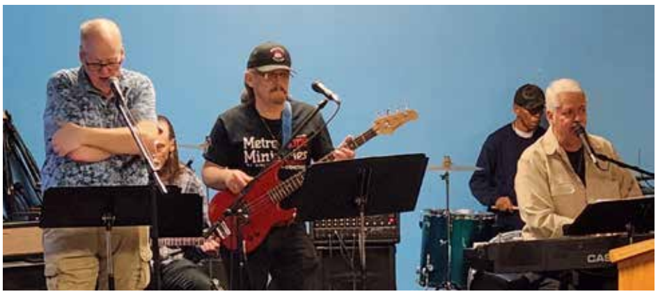
The JICF worship team playing at Metro Hope Center Chapel.